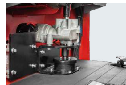
Electronic power steering system (for stand-up driving type tractor)