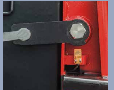
The locking device of the battery is provided with the safety protection function. Only if the locking device is rotated in place, the tractor can travel