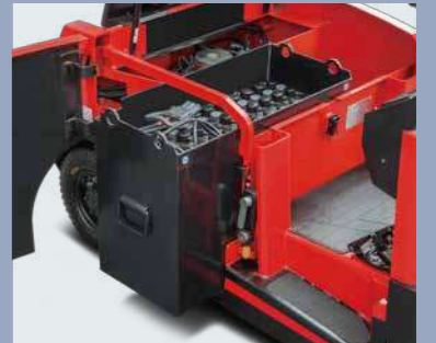
Battery side roll out is taken as the standard configuration in order to easily and fast replace the battery