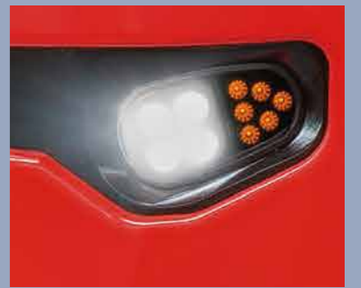
Reliable LED lighting