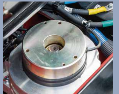
Electrical Park Brake (EPB) system