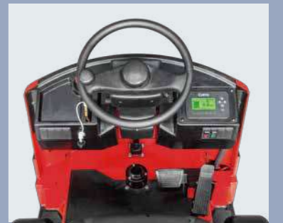
Modern outline design with LCD instrument and USB charging port